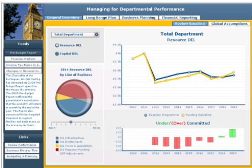
Planning & Performance Dashboard

Contact Rinedata today to discuss your first step to creating a world class system for your organisation.